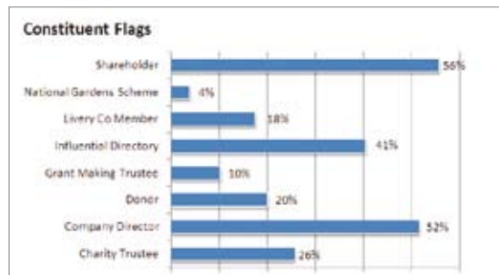
Examples of supporters' wealth & characteristics